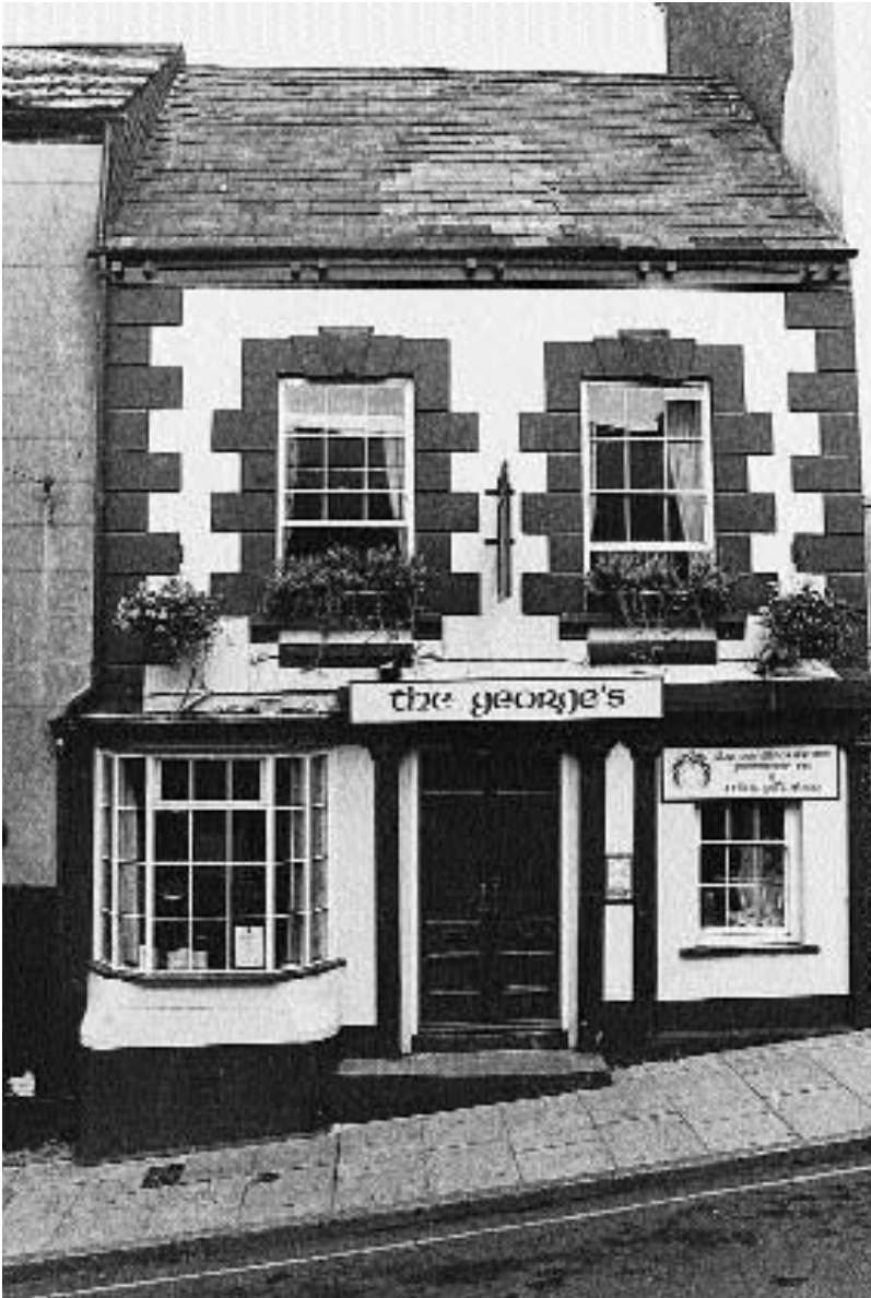
Figure 3.48 Haverfordwest, The George.

Figure 3.49 and shown in diagrammatic form in Figure 3.50 became the environmental areas where co-ordinated action or interventions were proposed.